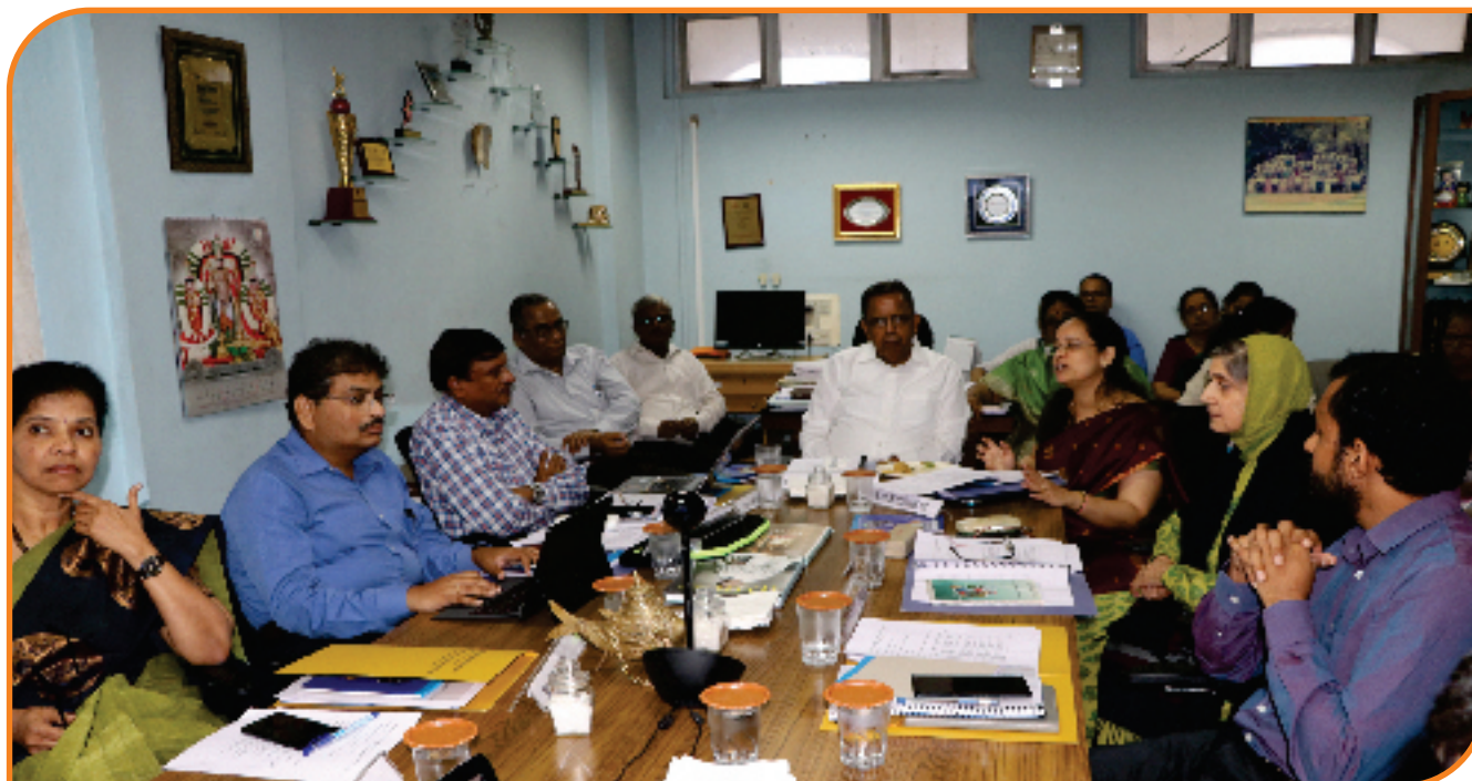
Pre SAC committee meeting on 23-24 th November, 2019 at NIIH