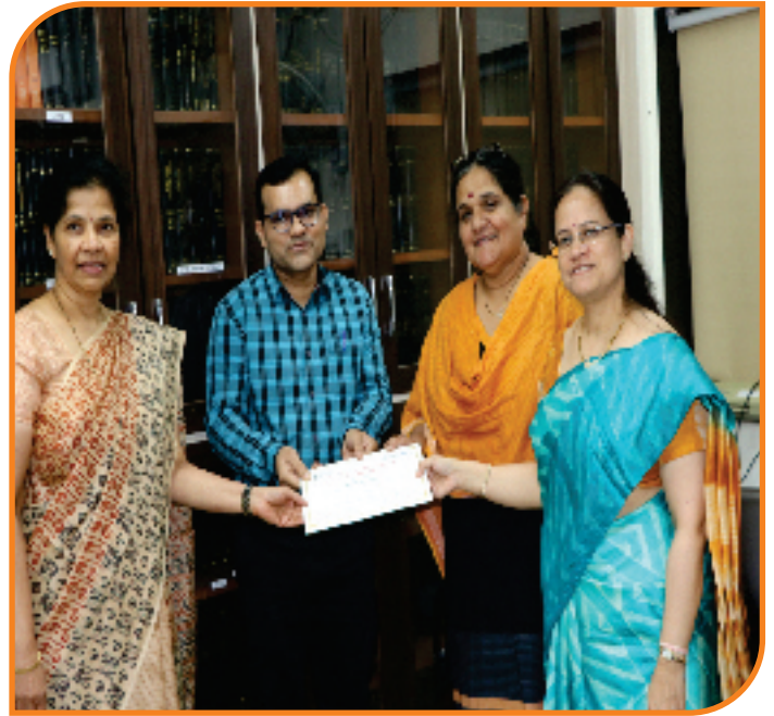
DBT fellowship program for six months in genetic diagnostics was initiated on 3 rd September 2019 for Training of in-service Clinicians” from Government hospitals