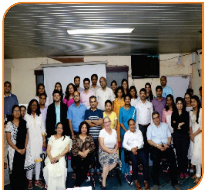
10 th Flow cytometry workshop & CME 30 th September -1 st October 2019 conducted at ICMR-NIIH